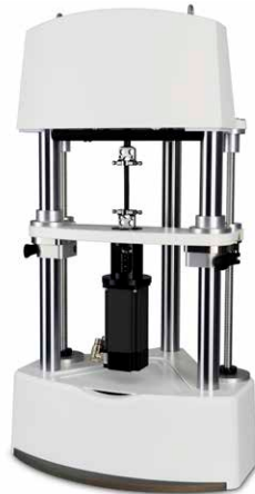
3200 Series III Axial/Torsion