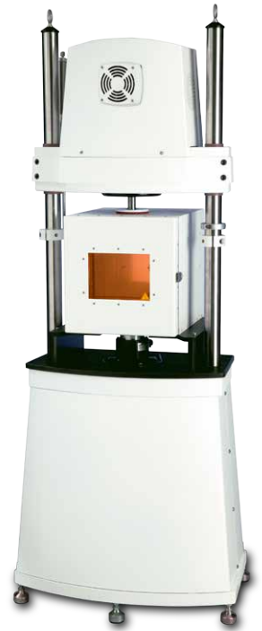
Floor-standing Axial/Torsion 3330 Series II with Hot/Cold Chamber