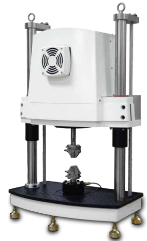
Table-top 3330 Series II

The ElectroForce 3330 table-top configuration is a clean stand-alone package that can be integrated with a variety of chambers and fixtures to meet specific test applications