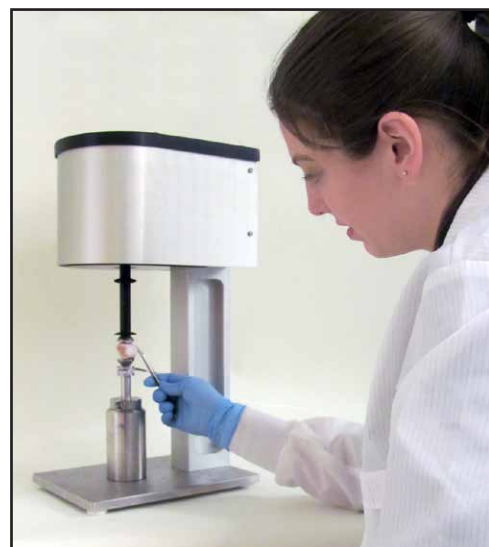
ElectroForce® 5500 Test Instrument

In addition to force and displacement sensors, a Digital Video Extensometer (DVE) can be incorporated to monitor and control strain based on Green-Lagrange calculations. The DVE includes a digital video camera, camera stand and LED light to record the movement of markers on a sample during loading. Video capture and analysis software are included for real-time calculations and monitoring of primary, secondary and shear strains.