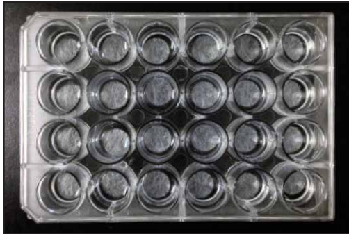
24-Well Plate with Hydrogel Disc Specimens

The ElectroForce® 5500 test instrument is designed to fit inside of a standard cell culture incubator, and all cables fit through a standard incubator port. The test frame features an overhead motor so that any spills can be easily cleaned without damage to the system. To ensure sterile contact with the sample, autoclavable fixtures are available, such as tensile grips, compression platens and bend fixtures. The system features standard mounting threads and can be easily adapted to accommodate customer-provided bioreactor chambers and fixtures. The sleek, clean design and compact size of the 5500 test instrument is well-suited for the testing and stimulation of biological constructs inside of a cell culture incubator.