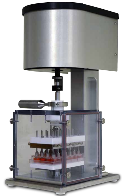
24-Well Plate Compressive Loading Fixture with the ElectroForce® 5500 Test Instrument

The base test system contains a telescopic shaft so that samples of various sizes can be mounted in the adjustable test space. This standard shaft can also be removed to accommodate larger fixtures and chambers, such as the 24-well plate fixture for compressive loading. This removable multi-specimen fixture includes an enclosure so that samples can be mounted under a flow hood before the fixture is transferred to the test system. Rows of compression pins can be locked in the retracted state for unloaded control samples. The maximum sample height per well is 5 mm and each platen assembly weighs 5 grams with pins in the unlocked state.